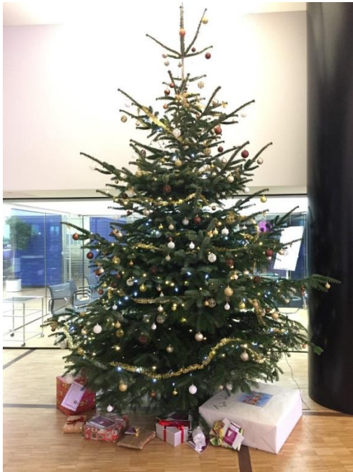
The first presents underneath one of Zumtobel Group's Christmas trees.